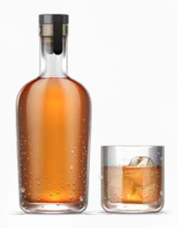
Ireland has the third highest EU+UK excise tax rate on spirits.