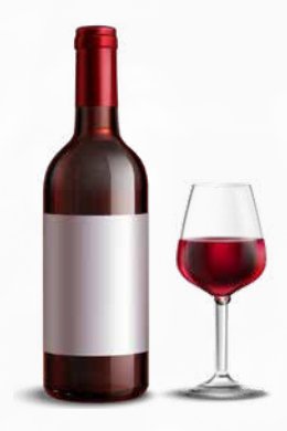
Ireland has the highest EU+UK excise tax rate on wine.